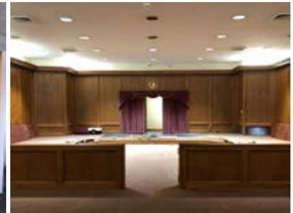
Interior - Courtroom

© 2020 CBRE, Inc. The information contained in this document has been obtained from sources believed reliable. While CBRE, Inc. does not doubt its accuracy, CBRE, Inc. has not verified it and makes no guarantee, warranty or representation about it. It is your responsibility to independently confirm its accuracy and completeness. Any projections, opinions, assumptions or estimates used are for example only and do not represent the current or future performance of the property. The value of this transaction to you depends on tax and other factors which should be evaluated by your tax, financial and legal advisors. You and your advisors should conduct a careful, independent investigation of the property to determine to your satisfaction the suitability of the property for your needs.