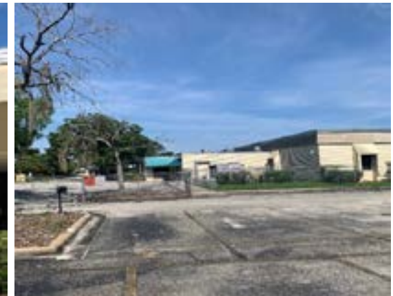
Exterior - Rear of Building