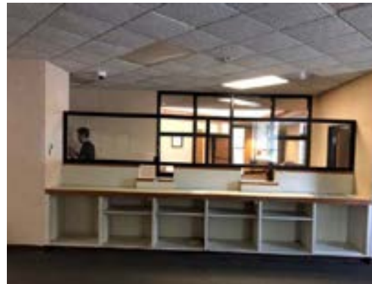
Interior - Administrative Offices

CBRE, Inc. | Licensed Real Estate Broker