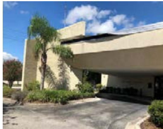
Exterior - Front Entrance